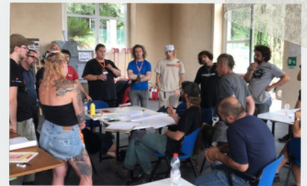
PRATOVECCHIO STIA, ITALY

Iron Notes Summer Camp is not just training: it is also sharing, passion and discovery. An opportunity to become an active part of a global community that transforms iron into culture, creativity and identity.