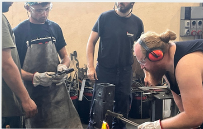
6-10 SEPTEMBER 2025